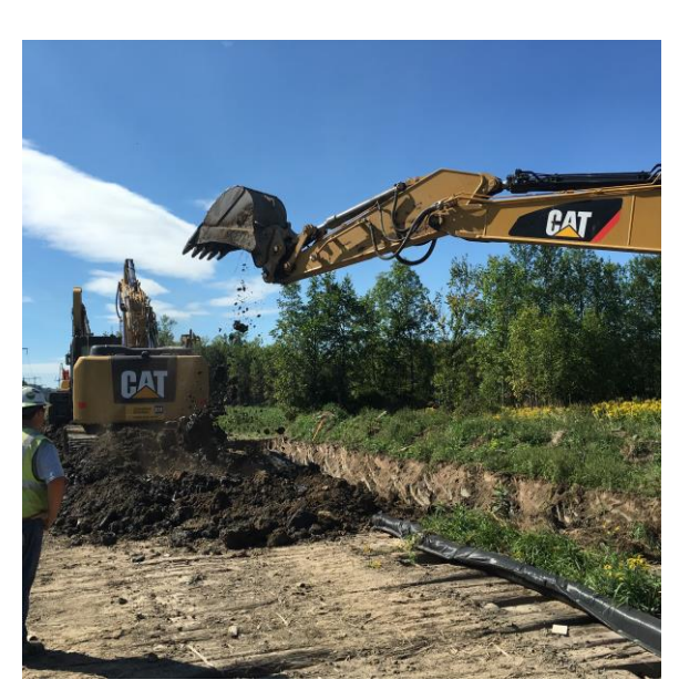
Photograph 4: Working off timber mats in stream buffer as excavation approaches stream 2012-SC-RS-5.