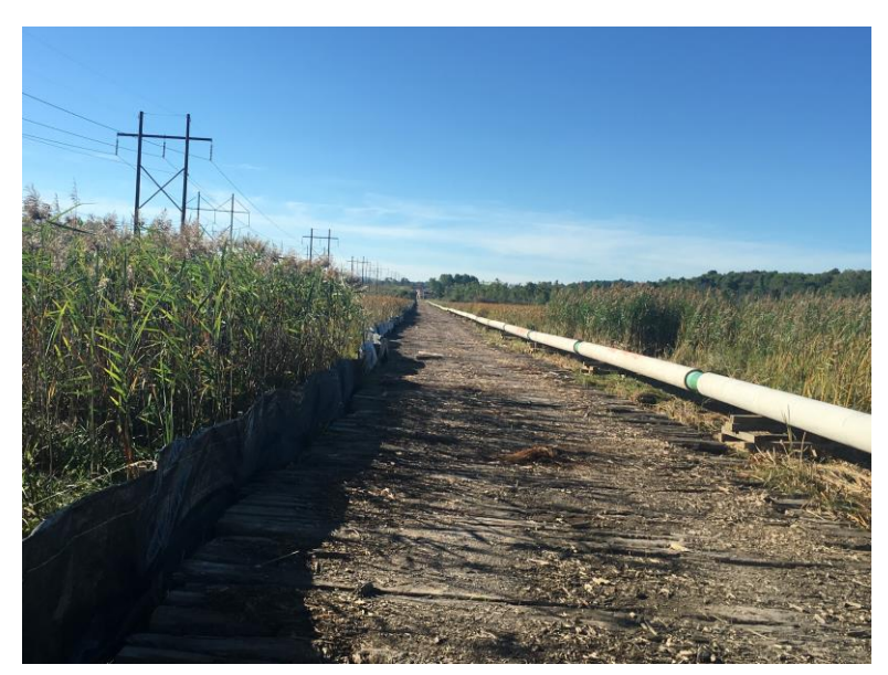
Photograph 7: New Haven Swamp viewed from the north facing south. No excavation to date.