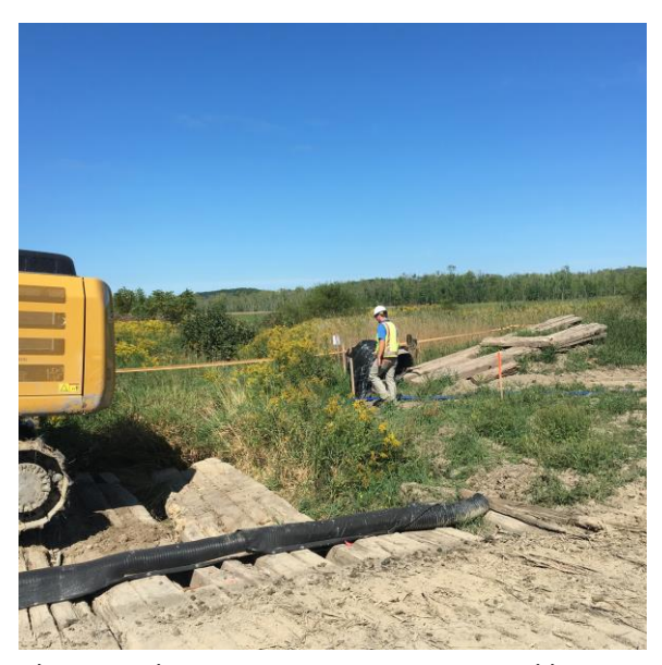
Photograph 3: Reviewing environmental layout in the field during look ahead prior to excavation of Stream 2012-SC-RS-5. Stream located at station 1635+00.