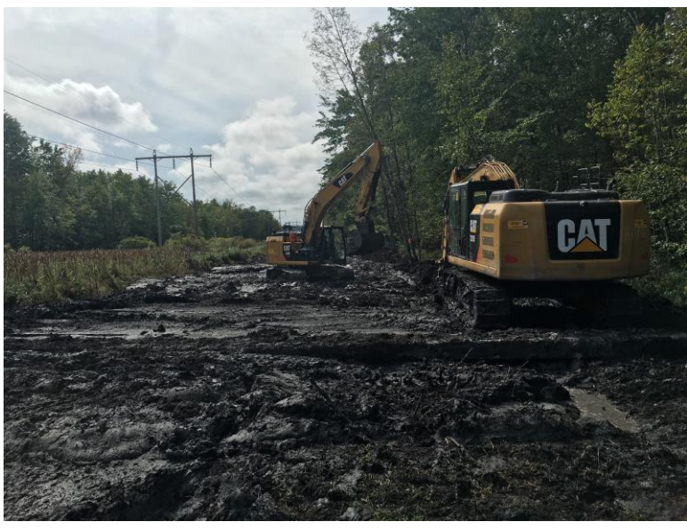
Photograph 6: Conditions were extremely challenging in the Red Maple/Green Ash Swamp. Crews continued to work off timber mats and managed to keep materials within the work limits to the best of their ability.