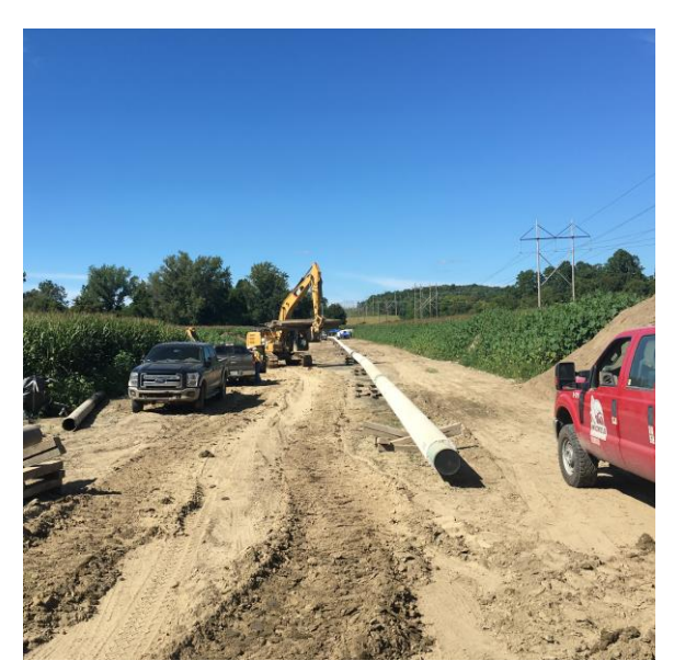
Photograph 9: River Road tie-in to the New Haven River HDD.