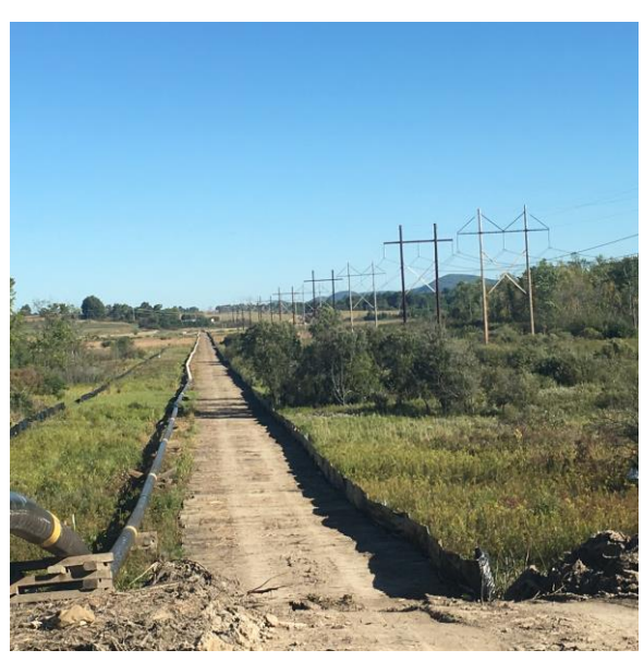
Photograph 8: New Haven Swamp viewed from the south facing north. No excavation to date.