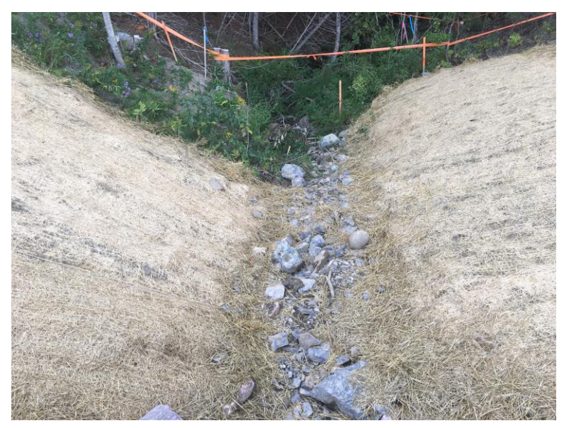
Photograph 1: Stream 2012-TB/SC-RS-3 crossing between Hollow Road and Post Road in Monkton is complete and restored. Stream is located at Station 1406+00. Stream was dry at the time of the crossing and remains dry as of the date of this report.