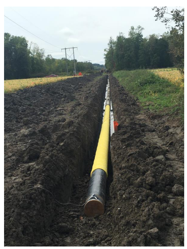
Photograph 5: Pipe installation leading into the Red Maple/Green Ash Swamp.